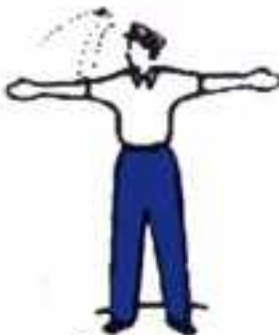
Beckoning vehicles approaching from right.