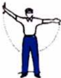
To stop vehicles approaching from the right to allow vehicles from the left to turn right.