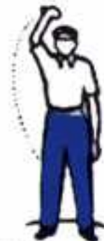
Beckoning vehicles from front.