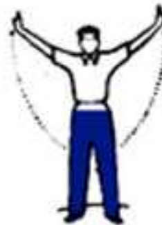
Warning signal closing all vehicles