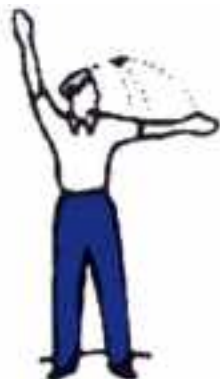
Beckoning vehicles approaching from left