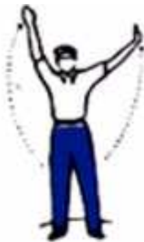
To allow vehicles coming from the right and turning by stopping traffic approaching from the left.